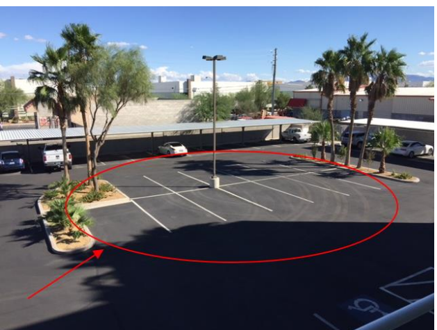
Please park in the un-covered spaces in the center of the lot.

TTi's new training facility in Las Vegas: 3471 W. Oquendo Road, Suite 202 Las Vegas, NV 89118